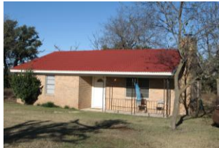
Gault fieldhouse 3433 FM 2843